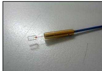
PM- Glass Ferrule