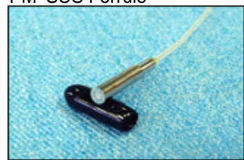
PM- SUS Ferrule