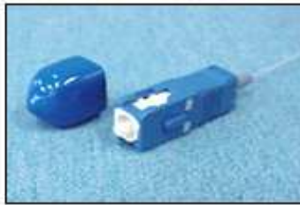
PM- SC Connector