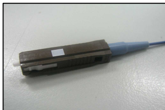
PM- MU Connector